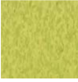
57510 kickin' kiwi