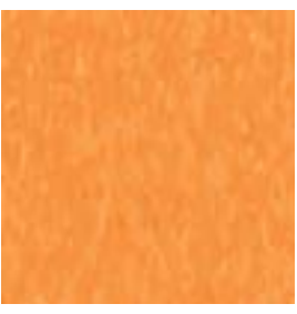
57516 screamin' pumpkin