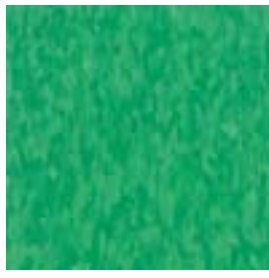
57511 grabbin' green