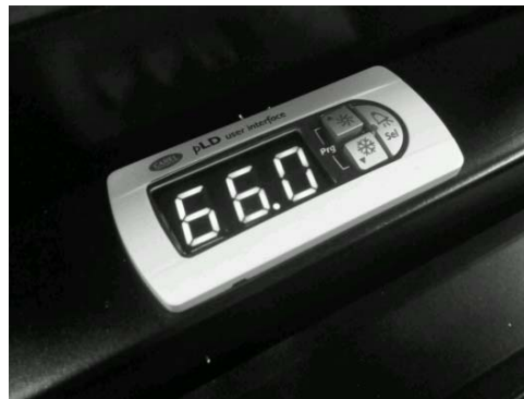
User set point control, display for peak temperature at rack