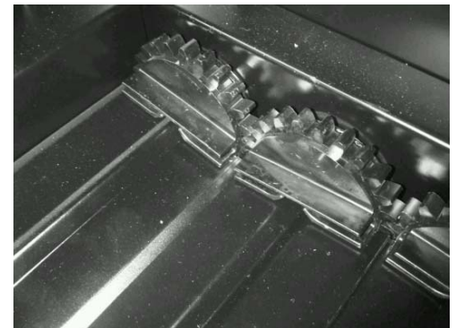
Heavy Duty Gear Driven Damper Control for high reliability