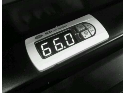
User set point control, display for peak temperature at rack