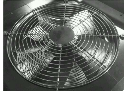
Energy Efficient EC fan runs only when required to meet demand